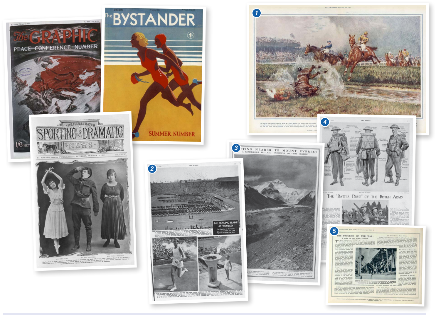
1. The Grand National, 1928. A dramatic illustration from The Bystander of a horse and jockey taking a tumble on the course. 2. The Olympics, 1948. John Mark carries the Olympic torch at the opening ceremony in London, shown in The Sphere. 3. Mount Everest 1953. Image from The Graphic depicts the mountain as Edmund Hillary and Tensing Norgay approach. 3. Mount Everest Image from The Graphic depicts the mountain as Edmund Hillary and Tensing Norgay approach. 4. The Second World War, 1939. The aftermath of the Munich Bürgerbräukeller bomb explosion from which Hitler narrowly escaped. 5. The Second World War, 1939. The Sphere shows details of British Army battle dress.

Its focus narrowed to countryside affairs and it became known as Farm and Country until it ceased publication. It included stories from writers including Agatha Christie and Bram Stoker and offers valuable material for the study of sport, drama, agriculture, and class dynamics.